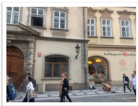
Celetna 562/20 (entrance)

We recommend you finding accommodation in the city centre (Praha 1) but if you couldn't find anything ok for you don't worry the public transportation system works very well in Prague. Here is the link where you can check it on the website: https://www.dpp.cz/en